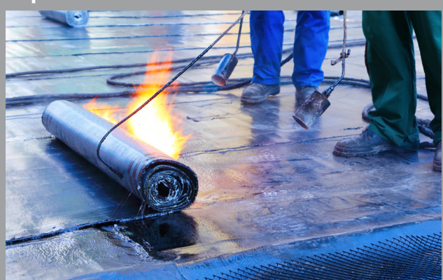
One of the common applications for these filters, is to address odors created during nearby tarred roofing replacement or repairs. Carbon pleats offer a good solution to a temporary problem.

The CityPleat features a combination filter that removes particulate, gases, and odors. It is recommended for use in all types of HVAC systems (both indoor and outdoor air) in a wide variety of residential and commercial applications when only a 2" or 4" space is available.